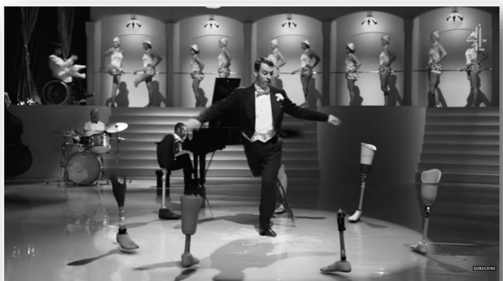
We're The Superhumans | Rio Paralympics 2016 Trailer