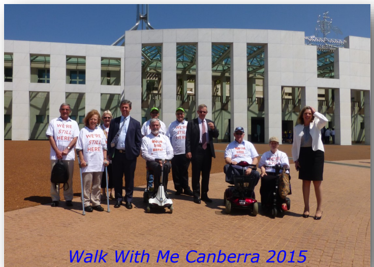
Walk With Me Canberra 2015